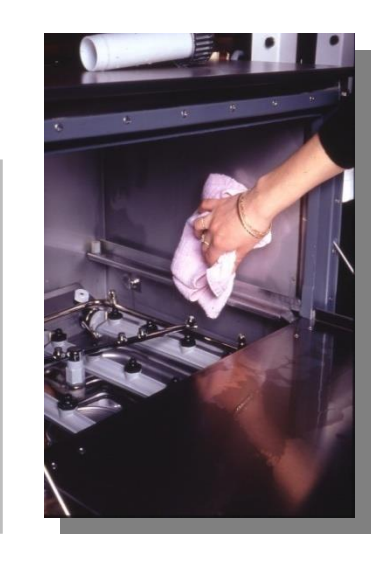
Check and clean filters