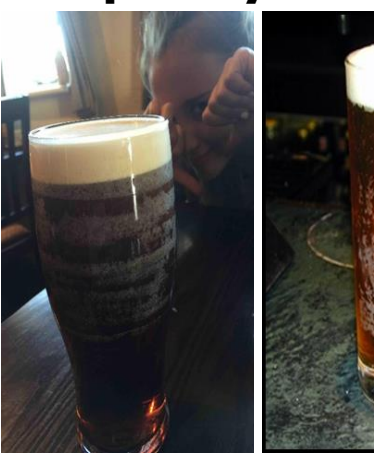
A dirty glass kills the head on beer